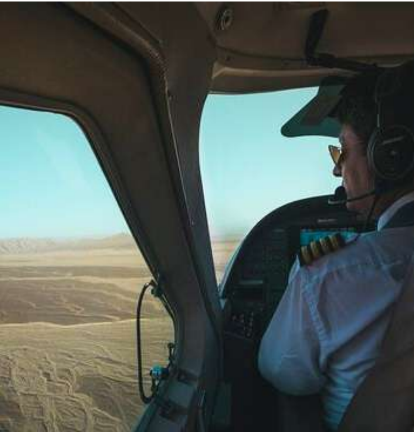
Nazca Lines Flight over the Desert.