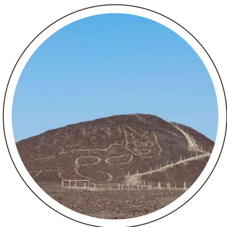
THE CAT GEOGLYPH NAZCA DESERT