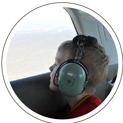
NAZCA LINES FLIGHT