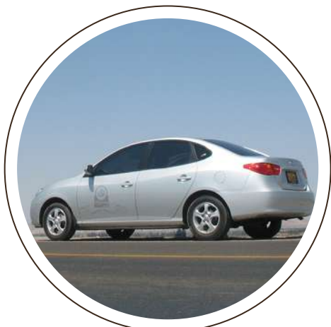
ICA - NAZCA PRIVATE TRIP