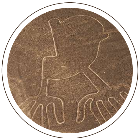
THE HANDS GEOGLYPH NAZCA DESERT