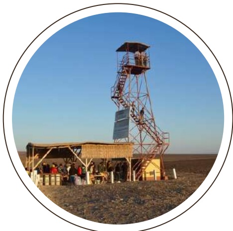
HUMAN GEOGLYPHS PALPA LINES