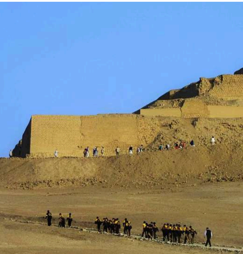
Ancient Sanctuary of Pachacamac