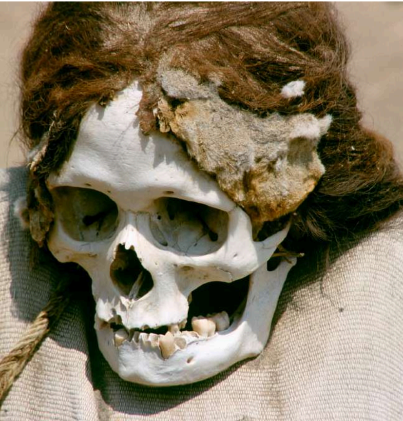
Ancient Mummy of Chauchilla