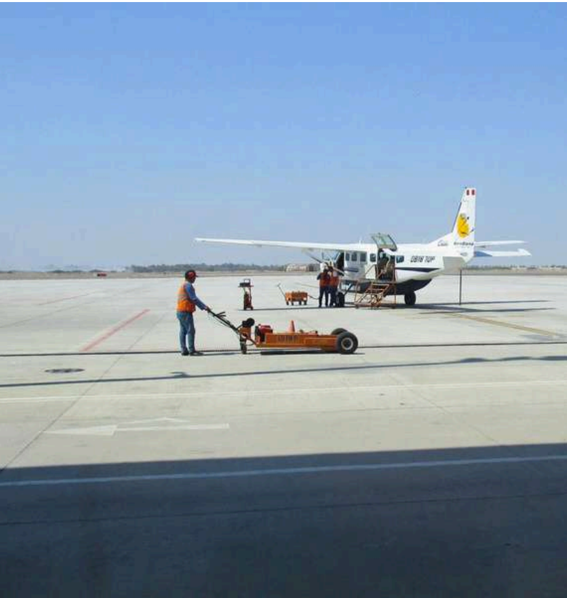
Cessna Caravan - Pisco Airport